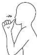
drink of water